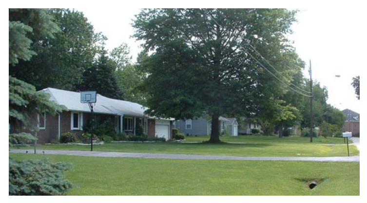
These photos illustrate the variety of existing buildings in New Albany, which date from the mid-19th to the late 20th centuries.