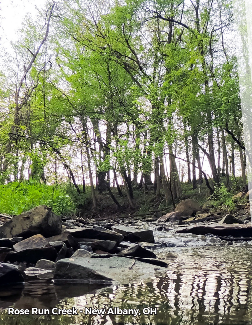
Rose Run Creek - New Albany, OH