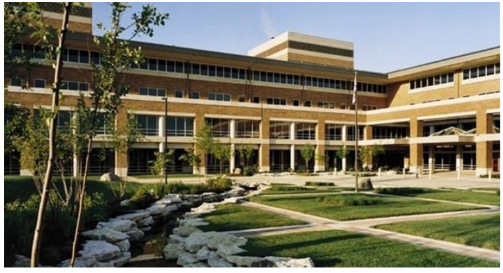
Open space and landscape features can create a setting that adds to the visual quality of largescale commercial development.