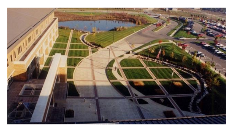
A good site plan considers placement of the building, parking areas, pedestrian access and landscaped open space.