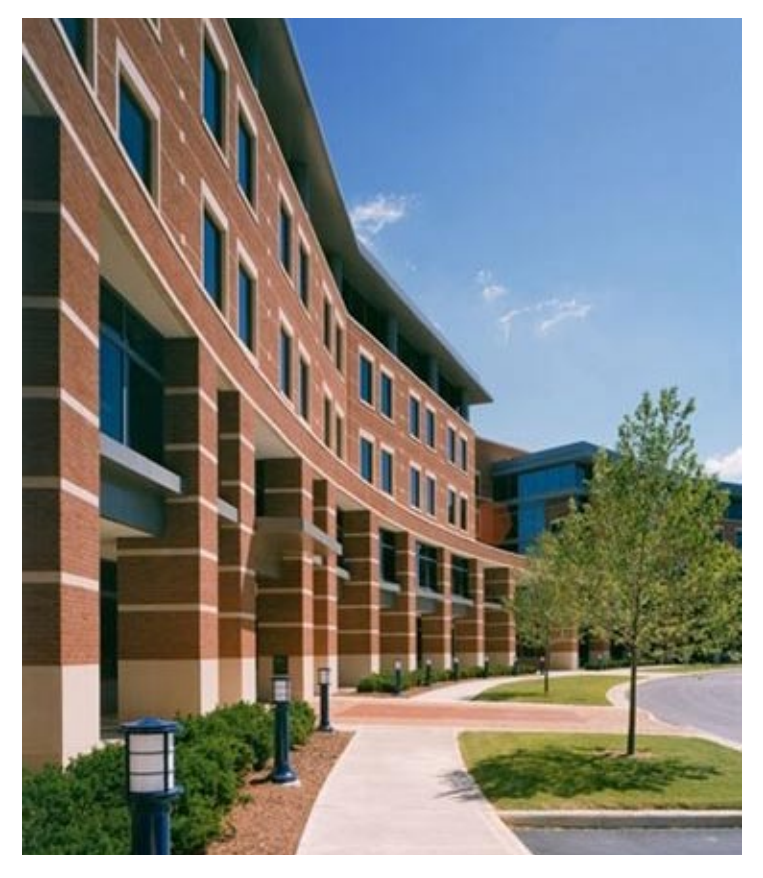
Simple, contemporary forms and designs are encouraged for commercial development outside the Village Center.