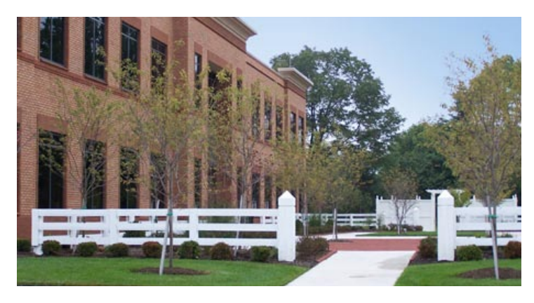
This large commercial building achieves a pedestrian-friendly scale through the landscaped courtyard leading to the building's main entrance.