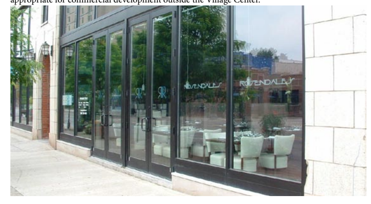
Storefronts can employ wood or metal framing systems to create the bulkhead, display window and transom typical of traditional storefront design.

Contemporary design with flat roof forms and the use of large window openings can be appropriate for commercial development outside the Village Center.