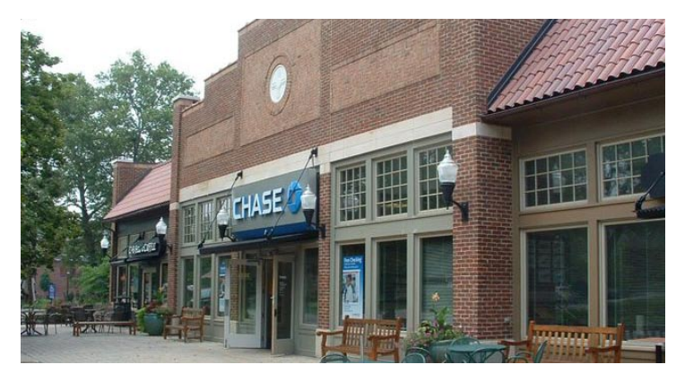
Commercial retail buildings outside the Village Center should avoid blank walls and create some pedestrian-friendly amenities.

Commercial buildings used for retailing commonly are one or two stories in height; those used for offices generally are greater than two stories in height. The standards below can be applied equally well to shopping centers, individual commercial office or retail buildings, and to office complexes.