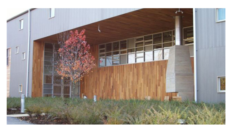
Isolated\ building\ sites\ provide\ the\ greatest\ opportunity\ for\ design\ flexibility, including\ scale, form, design and use of materials, as illustrated by these buildings.