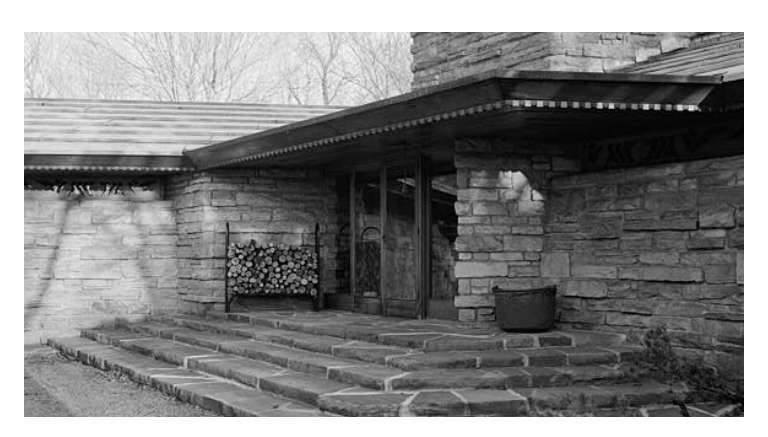
Building materials, such as metal siding, steel framing, large expanses of glass and field stone can create contemporary building designs such as these examples designed by Mies Van der Rohe and Frank Lloyd Wright.