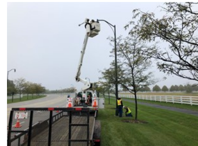
Service crew members installing a replacement streetlight pole.

Service crew members Shaun Bush, Rob Runyon and Tyler Myers install a replacement streetlight that had been hit by a motorist on New Albany Road East. When performing this task the bucket truck is utilized to hoist the new streetlight pole in place. Crews then securely bolt the pole and light base to the concrete foundation. Once the wiring is connected to the circuit and the luminaire installed, then the power is restored and the system checked for proper operation.