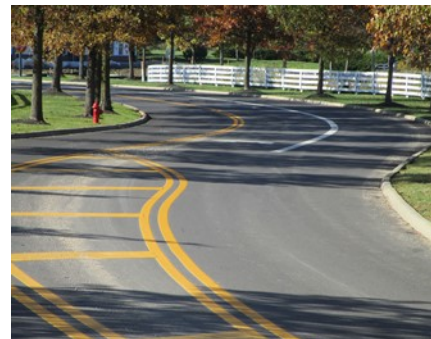
Repaved Bevelhymer Road