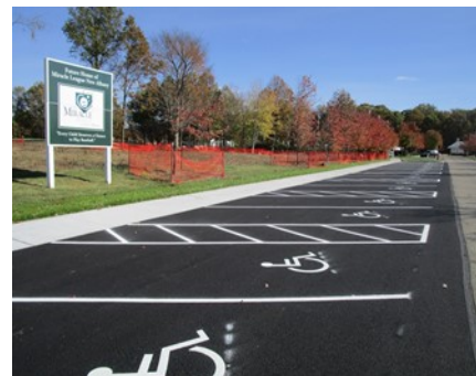
Miracle Field Parking Lot