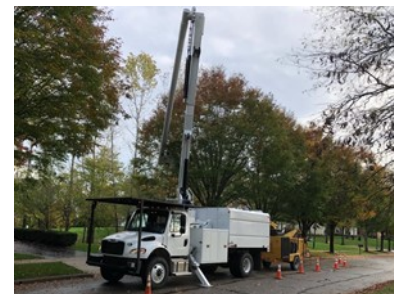
Forestry crew utilize a demo bucket truck unit designed for trimming trees.

Forestry Specialist Nick McPherson and Maintenance Worker Curtis Reed worked together to remove dead branches from the Japanese Zelkova trees on James River Road. While some of the Zelkova trees will still need removal in the future, others are recovering and can continue to provide many years of benefits with proper pruning. Zelkova trees can be difficult to prune because of how tightly the branches grow together. The bucket truck used was a free demonstration vehicle supplied to help the department learn more about what kind of truck will be appropriate for future needs.