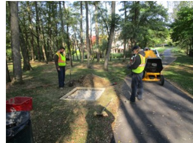
A pad is poured for trash & recycling receptacles at Fenway Pond

Maintenance workers Tyler Ashcraft and Ian Hurst construct a wood frame to pour a concrete pad for a new trash and recycling receptacle at Fenway Pond. Recently, residents have requested the placement of trash containers for convenience of park users. Last year, the city upgraded the asphalt leisure trails within the park and pedestrian use has increased giving way for the need for trash and recycling receptacles.