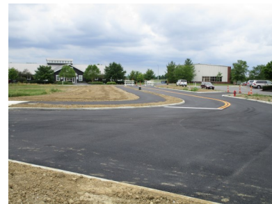
New Via Tessora Road looking west with curb and pavement completed.