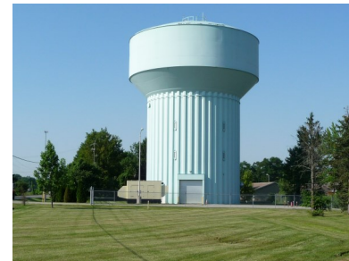
Current photo of Johnstown Road Water Tank before painting.