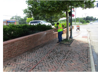
A power washer is used to clean the brick retaining wall on S. High St.

Maintenance Crew member Carl McNeal uses a power washer to remove a heavy build-up of mold and discoloration on the decorative brick retaining wall at South High Street. As the city street trees have matured along this stretch of public walk, the added shade has contributed to mold growth on the bricks.