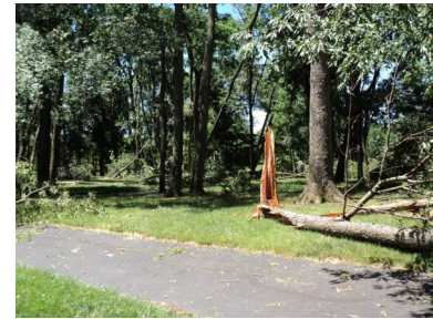
Many trees in Fenway Park were blown down during a June wind/rain storm.

On June 26th, high winds and heavy rain caused a moderate level of damage to city street trees and private property in New Albany. Service crews responded with clearing roadways for travel and removing fallen debris from city right-of-way areas. Also, assistance was provided to community residents who called in and requested brush pickup at the curb.