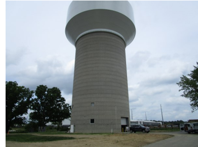
A view of the Beech Road Water Tank looking east from Beech Road.