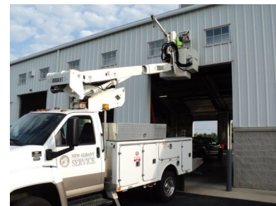
The bucket truck is used to install an LED light fixture over a service garage door.

Service Worker Rob Runyon uses the bucket truck to replace a standard building light fixture with a new LED style bulb. As a pilot project the service department is testing varying LED manufactured bulbs in city street light fixtures. Several locations throughout the community have been selected and bulbs replaced with LED lights. The determining characteristics are color, brightness and area of coverage.