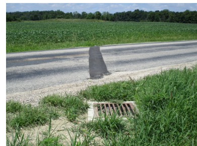
Installation of a new catch basin and culvert on Beech Road.

Service crews worked along a section of Beech Road just north of Morse Road installing a low profile catch basin and a roadway culvert pipe to outlet storm water. This project was a direct result of complaints received regarding flooding of Beech Road during Winter and Spring. The city recently took maintenance responsibility for Beech Road from Licking County and soon discovered a lack of proper storm drainage structures for the road system.