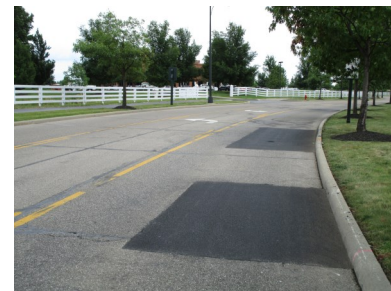
Surface patches were completed on Walton Parkway and other city streets.