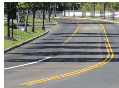
Microsurfacing was completed on Walton Parkway from SR 605 to US 62..