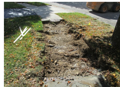
Tree roots growing beneath the concrete sidewalks have caused extensive damage.