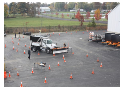
A sky view of a driver midway through the obstacle course.

Service crew members begin the winter season with a friendly snow roдео competition to test their snow plowing skills on an obstacle course set up in the service yard of the public service facility. Staff members from Village Hall participate as judges and prizes were awarded to all competitors. Before the roдео began crews were trained on snow and ice removal and were provided lunch.