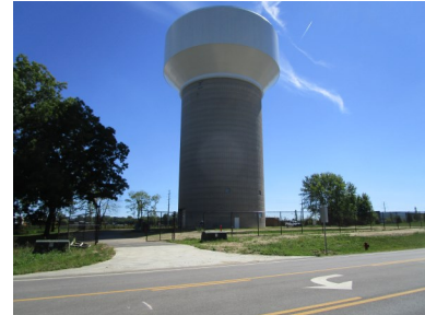
A view of the Beech Road Water Tank with the security fence installed.