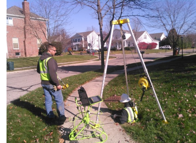
Crew members search for a solution to a sinking sidewalk.

Service crew members Ken Gray and Nick Cichanowicz perform sewer maintenance to the New Albany sewer system by operating a camera to inspect the interior of the sanitary line at Fern Ridge Drive. They were looking for deficiencies and potential problems that could be causing the sidewalk in this particular location to settle unevenly.