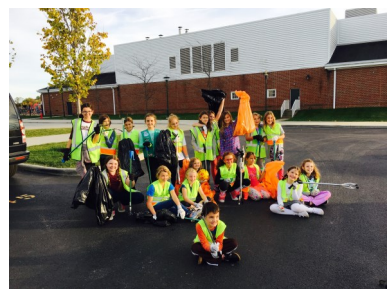
Girl Scout members pick up trash within our community.

Members of Girl Scout Troop #1195 volunteer to pick up trash at the city's Swickard Woods Park near the elementary school. While learning the valuable lesson about keeping their community clean, the scout troop collected one large bag of trash and one large bag of recycling, the girls also earned a badge for their efforts.