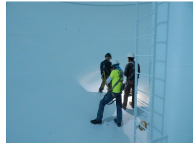
Crews are inspecting the paint applied to the inside of the tank bowl.