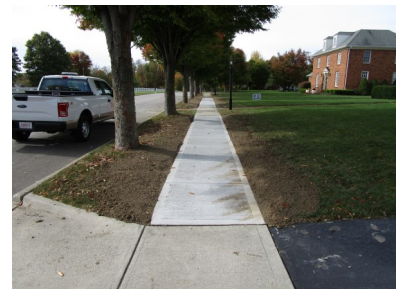
Completed sidewalks on James River Road.