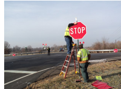
New four way stop installed at Dublin-Granville and Kitzmiller.

Service department crew members installed additional stop signs at the intersection of Dublin-Granville and Kitzmiller Roads to create a new four way stop condition. After conducting a traffic study of the intersection, the city engineer determined a four way stop was warranted. The intersection has been a location for several recent accidents involving north and west bound vehicles.