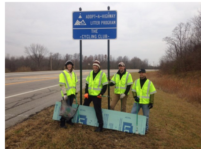
The Cycling Club collects trash on Dublin-Granville Rd.

Members of The Cycling Club joined forces to pick up trash along Dublin-Granville Road from Beech Road to Reynoldsburg/New Albany Road. Fifteen members of The Cycling Club who attended this event were able to collect 23 bags of trash equaling 805 lbs. of debris. The service department runs an Adopt-a-Roadway program for organizations to help beautify the community.