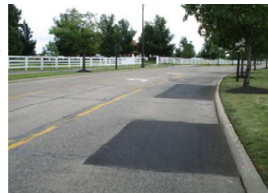
A view looking east on Smith's Mill Road.