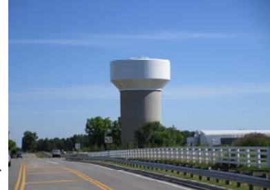
Completed Beech Road Water Tank.