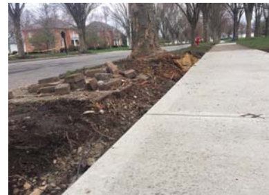
Completed sidewalks on James River Road.