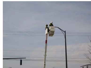
Streetlight repairs are routine tasks for maintenance crews.

Maintenance Worker Shaun Bush replaced the light fixture on a thirty foot tall streetlight pole at the corner of New Albany Road East and SR 605. Typically, the city has 25-30 street light repairs to perform each month, items consisting of replacing bulbs, ballasts or drivers. Because the bucket truck is needed for this work, repairs are grouped together and scheduled for the 1st and the 15th of every month.