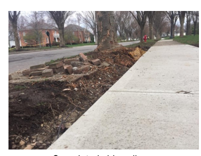
Completed sidewalks on James River Road.