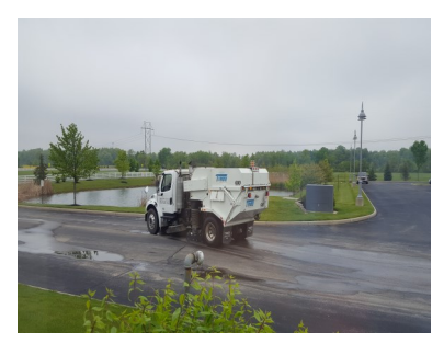
Street sweeping is a common occurrence now that the spring weather has arrived.

Thirty flower baskets from Bildsten Landscape Service were hung throughout the city last week to beautify the prominent corner light posts. The flowers will be watered twice a week from now through the end of September or so. The cost of the baskets fell just over $1,800.00.