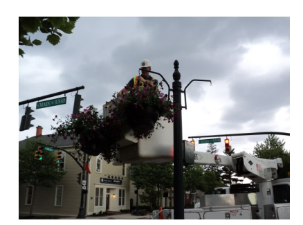
Brent Rush is hanging the city flower baskets; a sure sign of summer.