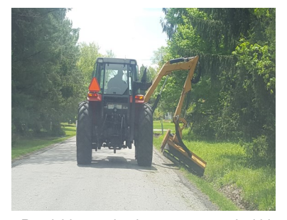
Roadside mowing has commenced within the city.