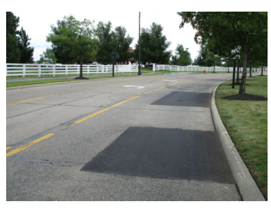
A view looking east on Smith's Mill Road.