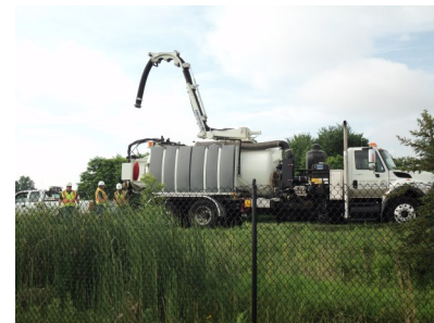
The jet vac is utilized at the PSD facility to keep drains clear.

Maintenance staff Carl McNeal, Jerry Smith and Nick Cichanowicz use the service department sewer truck to jet clean a drainage tile used to channel water away from the service yard dump pad. Ohio EPA regulations for good housekeeping require muddy water to be filtered clean before it gets into local streams and water ways. This particular drain tile outlets into a grass swale where sediment can filter out before the water can reach the service pond.