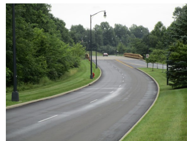
Smith's Mill Road microsurfacing project east of Kitzmiller Rd.