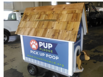
The PUP wagon was designed to gain public interest in this stormwater program.

PUP (pick up poop) is a local campaign developed to educate and motivate the public to pick up after their dogs. FSWCD has designed the program as a stormwater initiative to keep streams clean by eliminating bacteria and contamination from pet waste. Maintenance Supervisor Steve Kidwell built the dog house as a prop to advertise the program and store dog bag dispensers used by volunteers to distribute at community events.