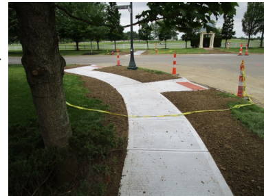
A view from Pembroke Pass looking towards Lambton Park Rd.