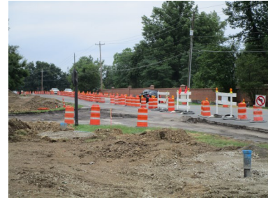
New traffic patterns are found on Johnstown Rd. to maintain traffic flow.