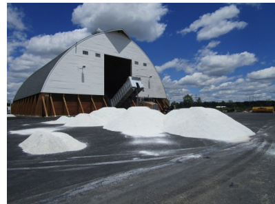
It looks like snow, but it is the salt deliveries being stacked in the storage barn.

Salt deliveries were scheduled for the month of June taking advantage of dryer weather for piling salt and to ensure that an adequate supply is on-hand for the coming snow season. Approximately 1100 tons of salt was purchased for just over $57,000. With this most recent delivery and the road salt already in the barn the city has a total amount of 3,500 tons.