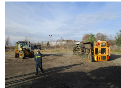
Using the city front end loader, service crews flipped a school bus on its side.

Maintenance Worker Carl McNeal worked with representatives from the New Albany Plain Local School District to flip a school bus onto its side at the Districts school bus facility. The bus will be utilized in practice and training exercises for the Plain Township Fire Department to prepare for emergency evacuation of students in the event of a real bus turn-over accident.