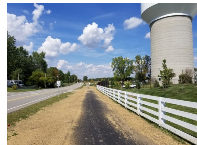
A new leisure trail was installed in front of the Beech Road Water Tower.