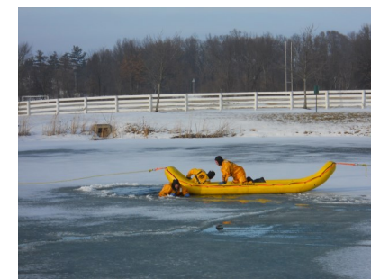
PTFD conducted ice rescue training at the public service department pond.

Each year the Plain Township Fire Department utilizes the frozen pond located at the public service department for training exercises and emergency rescue practice. First responders immerse themselves in the frigid water and utilize an inflatable boat to rescue each other. A pulley system is set up from two sides of the edge of the pond to pull the boat to shore, assisting in the rescue efforts.