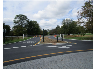
A view looking west at the roundabout connection to Greensward Road.