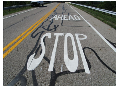
New pavement striping was performed on Kitzmiller Rd. at Dublin-Granville Rd.