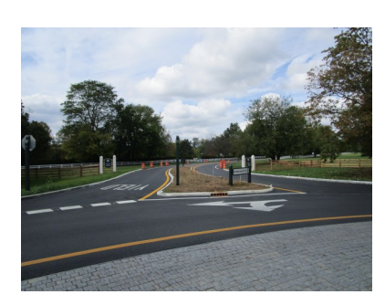
A view looking west at the roundabout connection to Greensward Road.