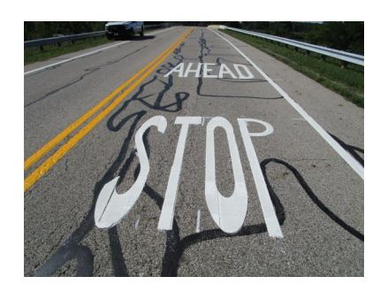
New pavement striping was performed on Kitzmiller Rd. at Dublin-Granville Rd.