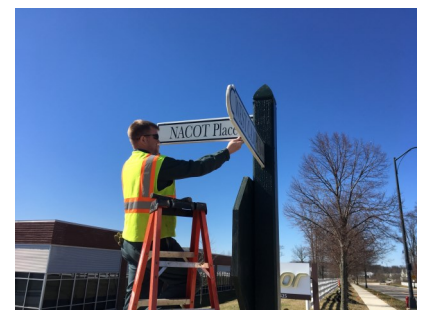
A new street name sign was installed in the business campus.