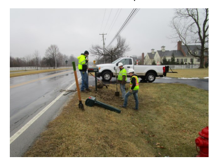
Mailboxes are sometimes damaged by the plow trucks during the winter months.