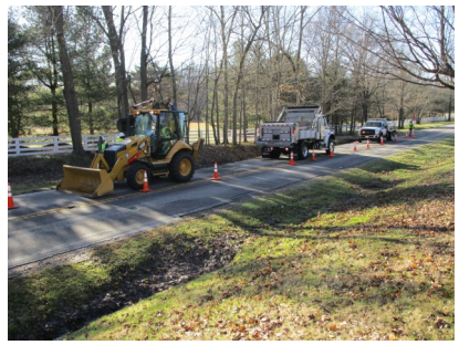
A public service team works diligently to repair the ditch along Kitzmiller Rd.