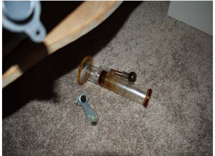
Evidence from the Search Warrant.