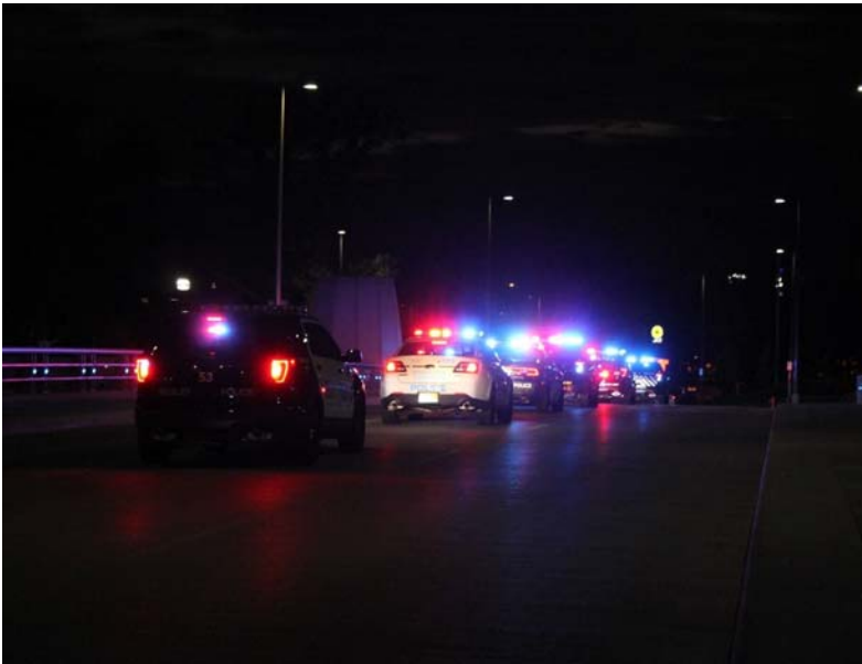
Franklin County's Light Ohio Blue Campaign