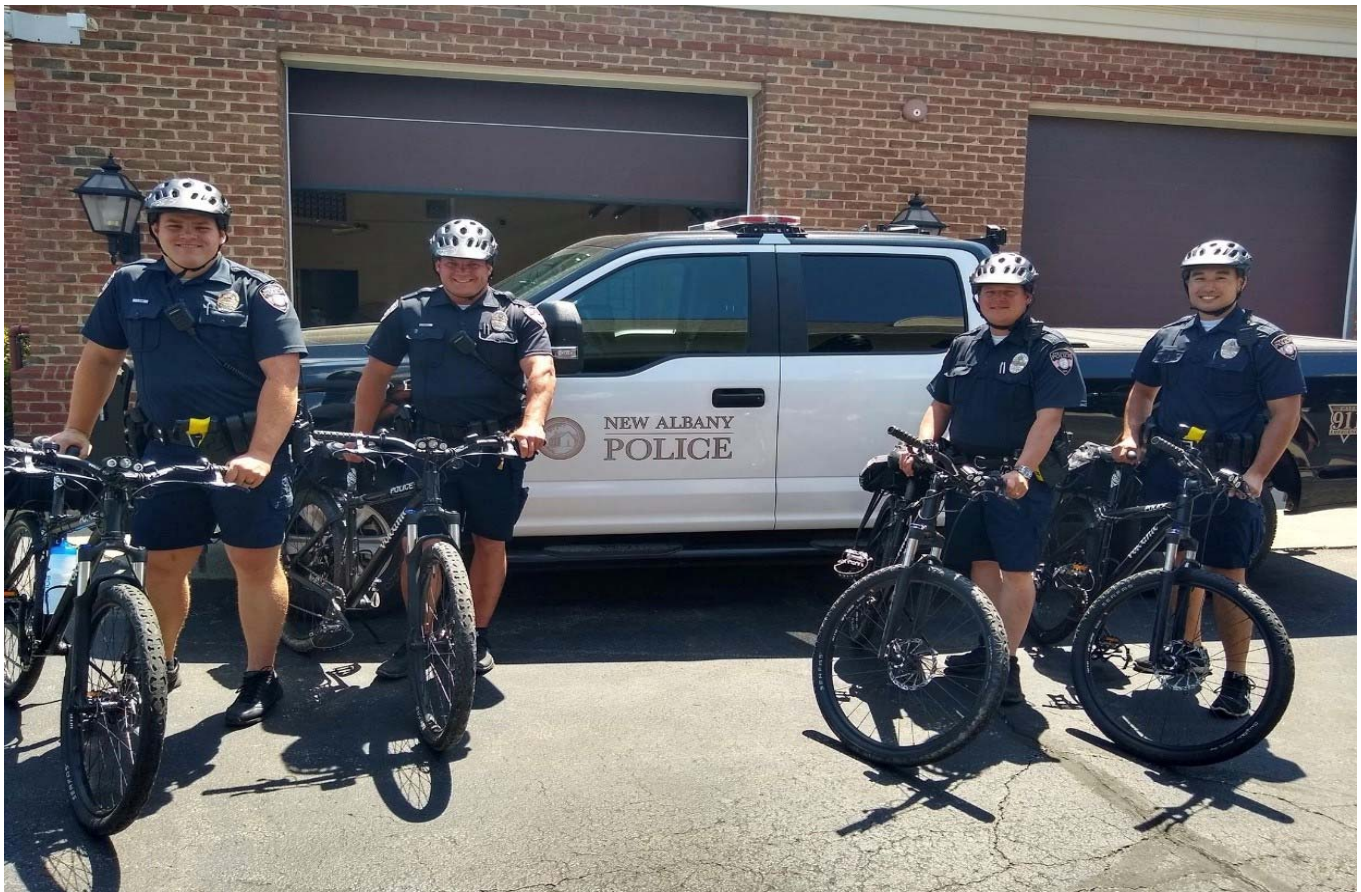
New Albany Bike Patrol Officers

On May 18 New Albany Police Department provided security and traffic control for the Founder's Day parade and carnival. A New Albany Police Department Cruiser lead the parade while bike officers and patrol officers ensured perimeters were maintained.