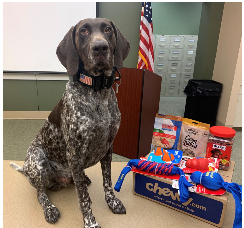
K9 Amigo posing proudly with his new box of treats and toys.

Amigo was featured on the Ohio Going Blue Facebook page this month. He was nominated by multiple New Albany residents in various Ohio Going Blue Contests. He was randomly chosen as the winner for one giveaway and received a fun box filled with treats, toys and more.