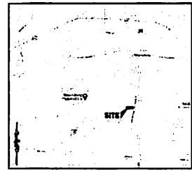
LOCATION MAP SCALE: NTS

INDEX OF DRAWINGS SHEET TITLE SHEET NUMBER TITLE SHEET 1 GENERAL NOTES 2 SITE PLAN 3