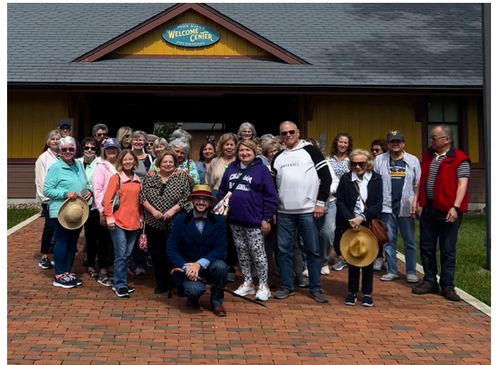
Trip to Ohio Village