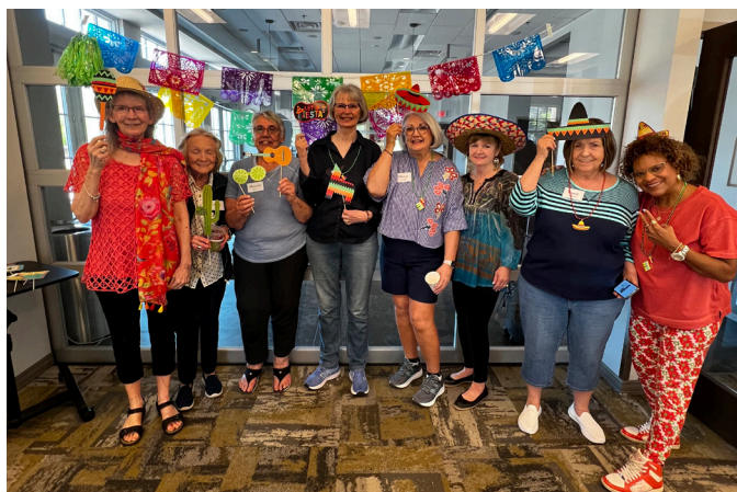
Cinco De Mayo Celebration Thursday Connections