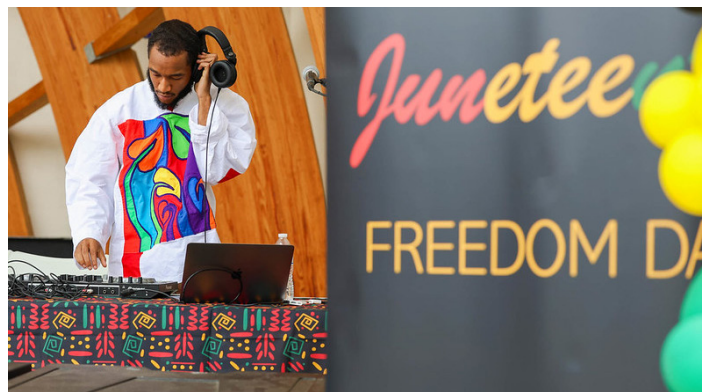
2023 Juneteenth Celebration