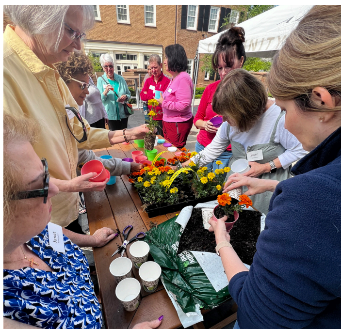
Mimosas and Marigolds Thursday Connections