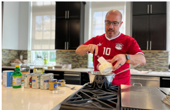
Sam's Egyptian Street Food Thursday Connections