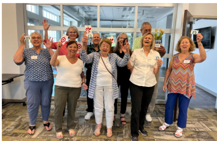
May Bingo Winners