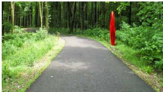
Sculpture in the Woods Along the Path