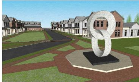
Sculpture in Neighborhood Setting