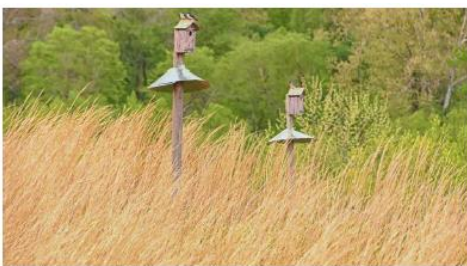
Artistic Bird Boxes in the Meadow