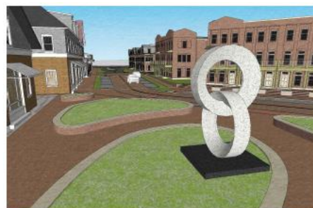
Sculpture in Commercial Setting