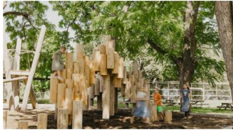
Neighborhood Playground - Moku Yama 7.1