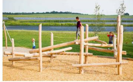
Neighborhood Playground - M7 Log Jam