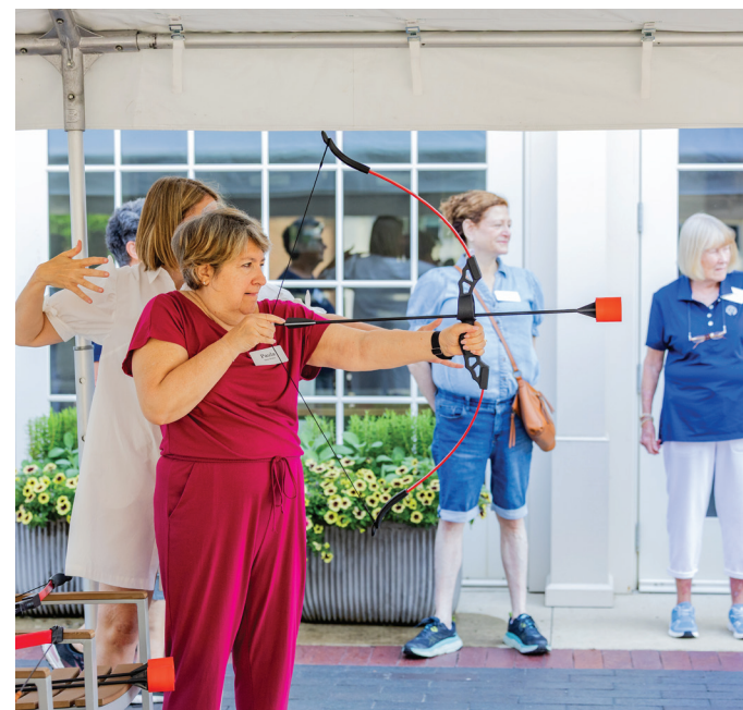
Archery at Thursday Connections