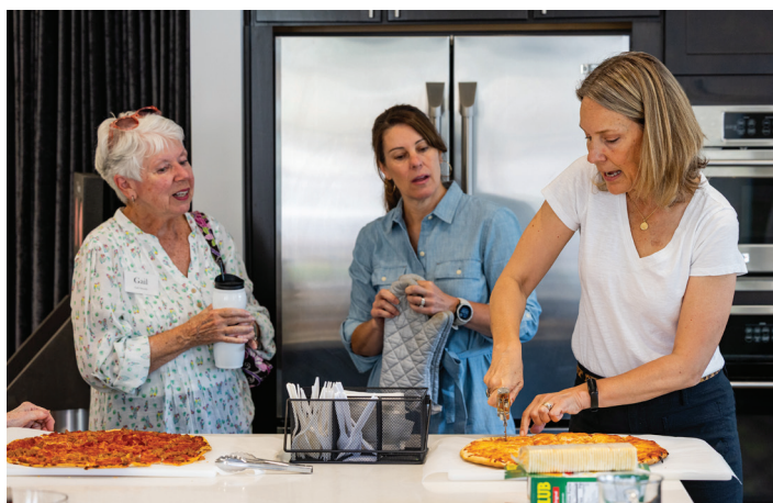
Snacks at Thursday Connections