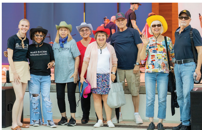
Members at Grassinine Summer Concert