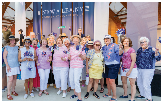
Members at the McGuffey Lane Concert