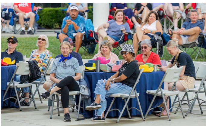
Members enjoying Grassinine at the Summer Concert

Location: Philip Heit Center - Classroom