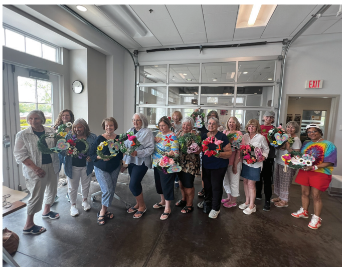
June Craft Class