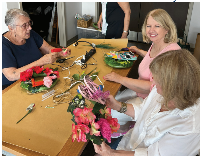
Members at Craft Club